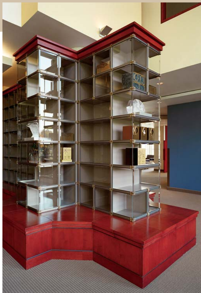
Urgel Bourgie Funeral Complex, Montréal, QC <

With CMC's broad range of knowledge and design expertise, we can help you maximize your cremation options in this ever changing marketplace.