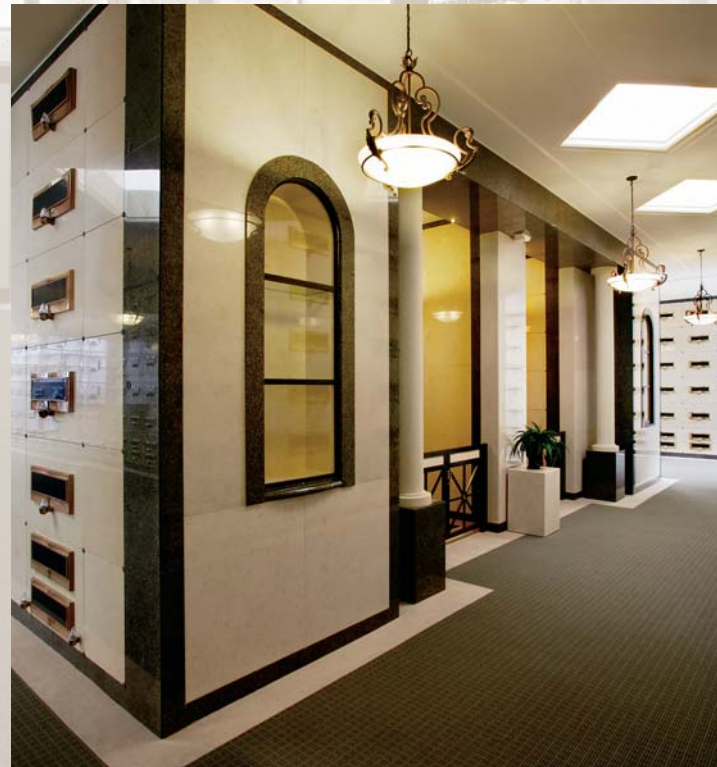
Serenity Mausoleum, Forest Lawn Cemetery, < Buffalo, NY