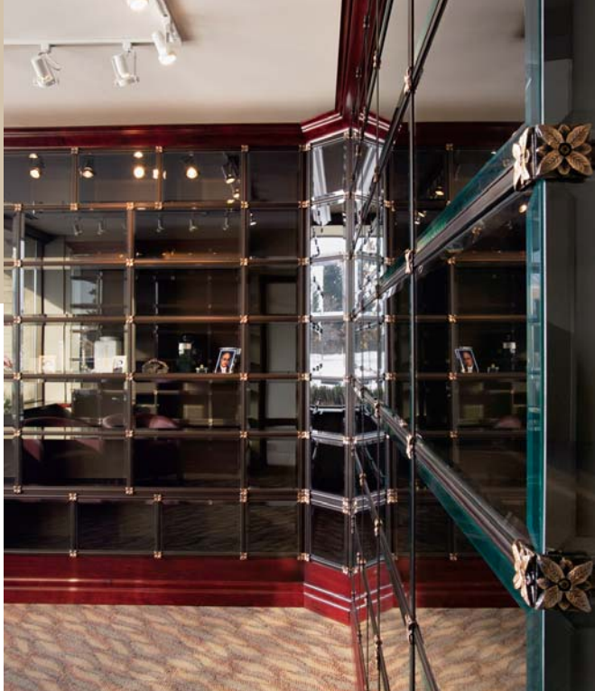
Mausoleum of Heavens, Richmond Hill, ON <

When working with our clients, we ensure to consider many marketing factors and opportunities within their cemetery, such as chapels on site not being used, features within sections, stained glass, etc. These will increase the marketability and aesthetic appearance of any interior niche section.