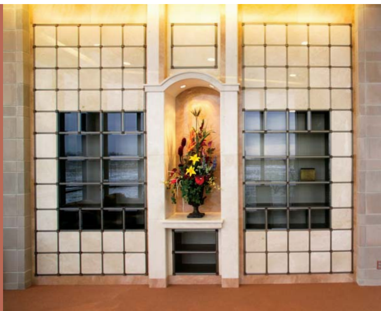
Lady of the Angels Mausoleum, Stoney Creek, ON <