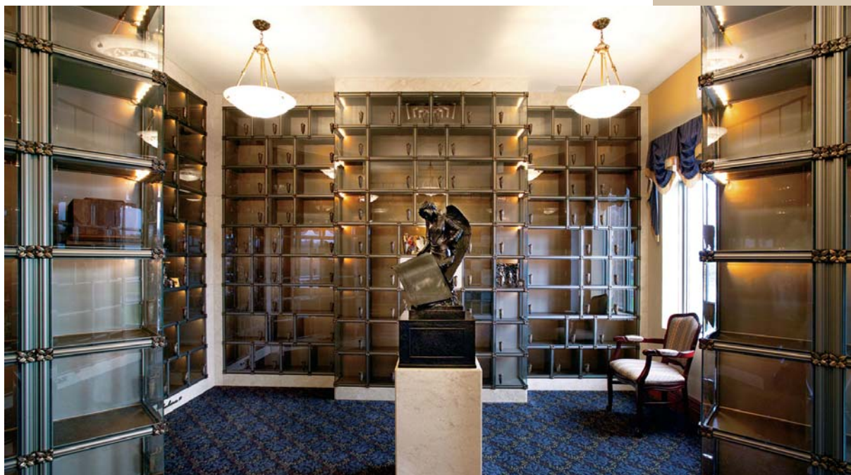
Girardot & Ménard Funeral Complex, Granby, QC <

Since the inception of cremation in today's society, most cemeteries met the interment and memorialization need for the consumer by either in ground burial or an above ground exterior columbarium.