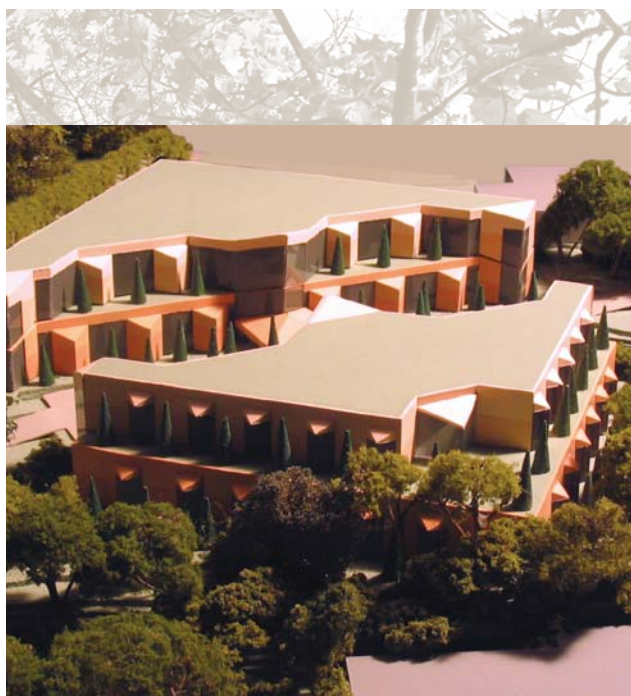
Mausolée du Plateau, Notre-Dame-des-Neiges Cemetery, Montréal, QC <

CMC is proud to contribute to the construction of this magnificent mausoleum, whose beauty and originality is sure to reflect the tradition of excellence that has been the hallmark of Montréal's Notre-Dame-des-Neiges Cemetery. Under the able leadership of Mr. Yoland Tremblay, the new mausoleums, as well as the landscaping of the areas bordering them, will reinforce the cemetery's status as an extraordinary green space that is unique to Montréal, where the greatest respect is paid to those who rest in peace within its splendid confines.